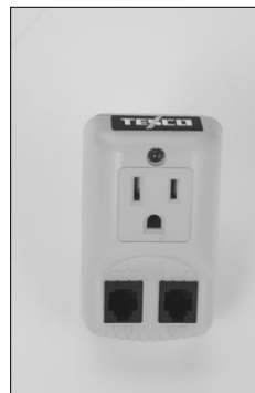
1 outlet cube