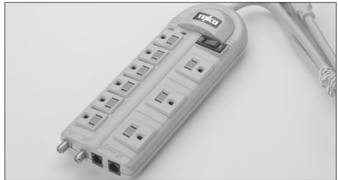
Plug strip with coax and telephone connectors