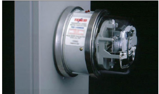
200 amp meter base adapter

Contact the Member Engagement Department for product, price, warranty and installation information.