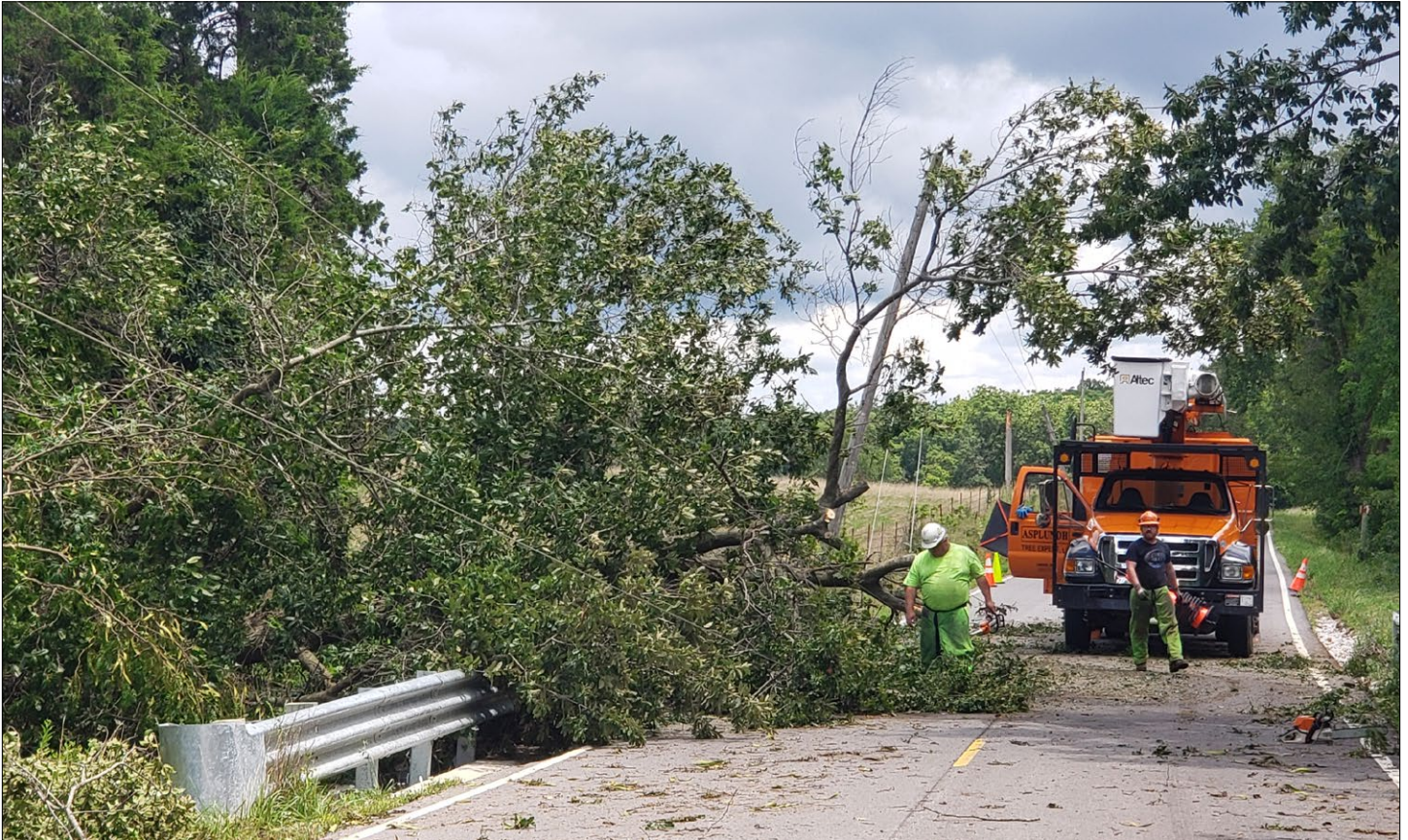
Contract crews work on removing trees that took down power lines after a summer storm.

Trees are important in our community. But a tree growing in the wrong place can be a hazard. This is one of many reasons the cooperative trims or removes trees that are close to power lines. When you work with tree or landscape projects, you can prevent electrical safety hazards and power interruptions if you plant trees with these safety measures in mind.