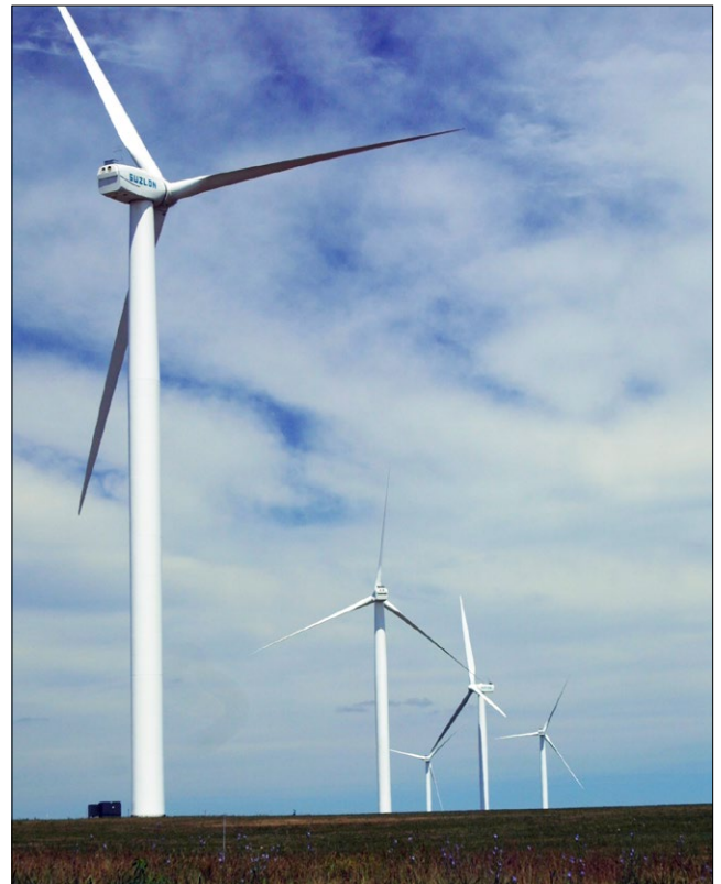
Bluegrass Ridge Wind Farm in northwest Missouri

To enroll in CREC's Green Power Program, contact a billing or member services representative.